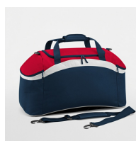
French Navy/Classic Red/White