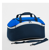
French Navy/Bright Royal/White